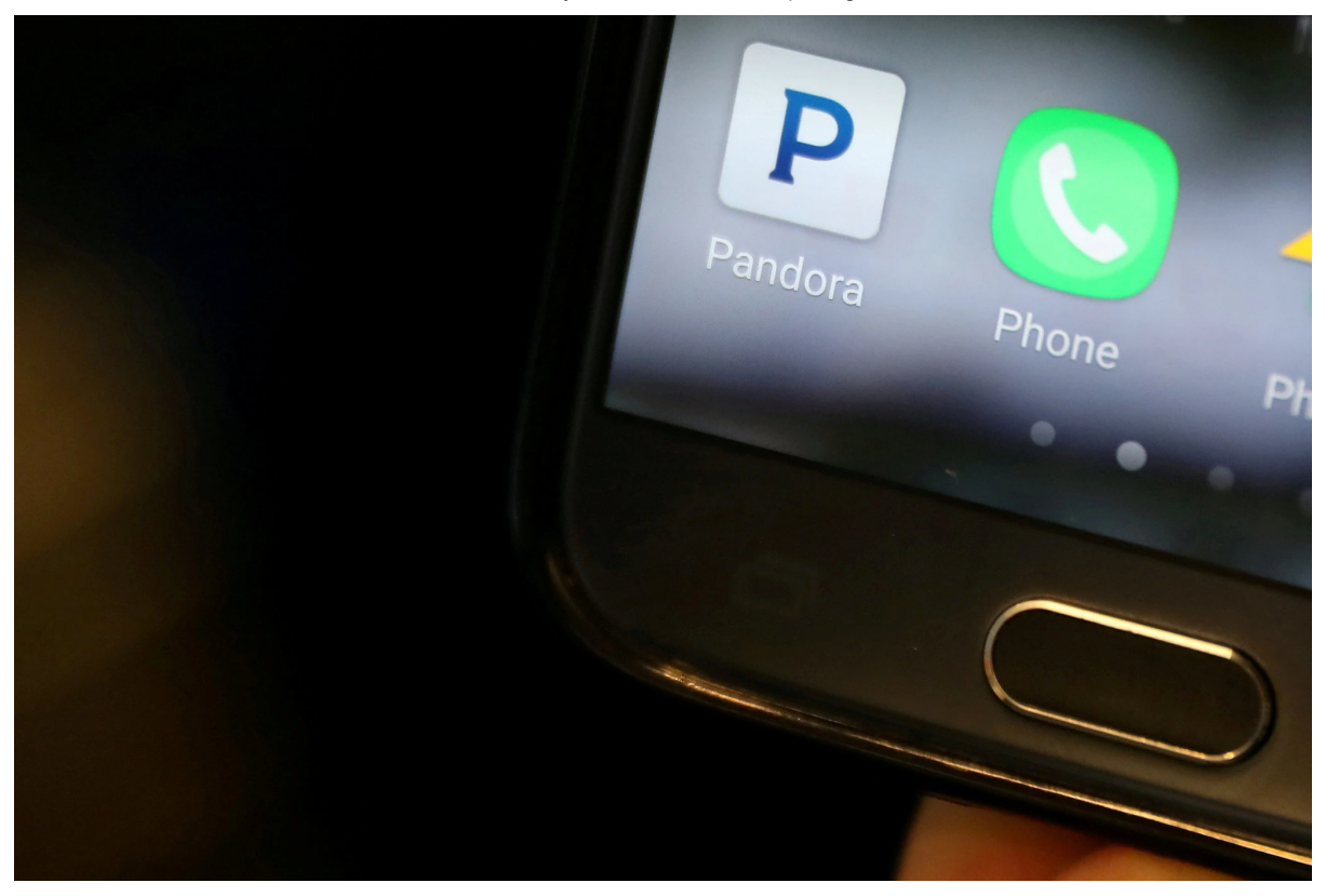
Facebook continued the access for Pandora, the music-streaming service, and other companies even after an F.T.C. agreement led to an official change in policy.

Facebook officials said the data sharing did not violate users' privacy because it allowed access only to public data — though that included data that the social network had made public in 2009. They added that the social network made a mistake in allowing the access to continue for the three companies, but declined to elaborate. Spokeswomen for Pandora and Rotten Tomatoes said the businesses were not aware of any special access.