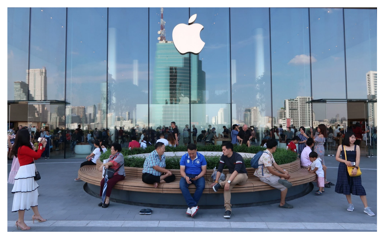
Facebook enabled Apple devices to conceal that they were asking for data, making it impossible for users to disable sharing.

Apple officials said they were not aware that Facebook had granted its devices any special access. They added that any shared data remained on the devices and was not available to anyone other than the users.