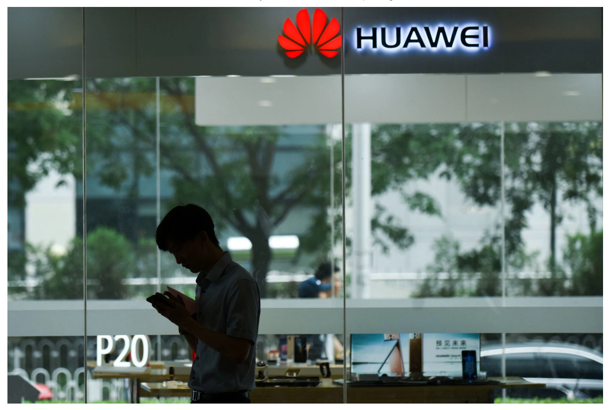
One of Facebook's device partners was Huawei, a Chinese company flagged as a security threat by United States intelligence.

Facebook also allowed Spotify, Netflix and the Royal Bank of Canada to read, write and delete users' private messages, and to see all participants on a thread — privileges that appeared to go beyond what the companies needed to integrate Facebook into their systems, the records show. Facebook acknowledged that it did not consider any of those three companies to be service providers. Spokespeople for Spotify and Netflix said those companies were unaware of the broad powers Facebook had granted them. A spokesman for Netflix said Wednesday that it had used the access only to enable customers to recommend TV shows and movies to their friends.